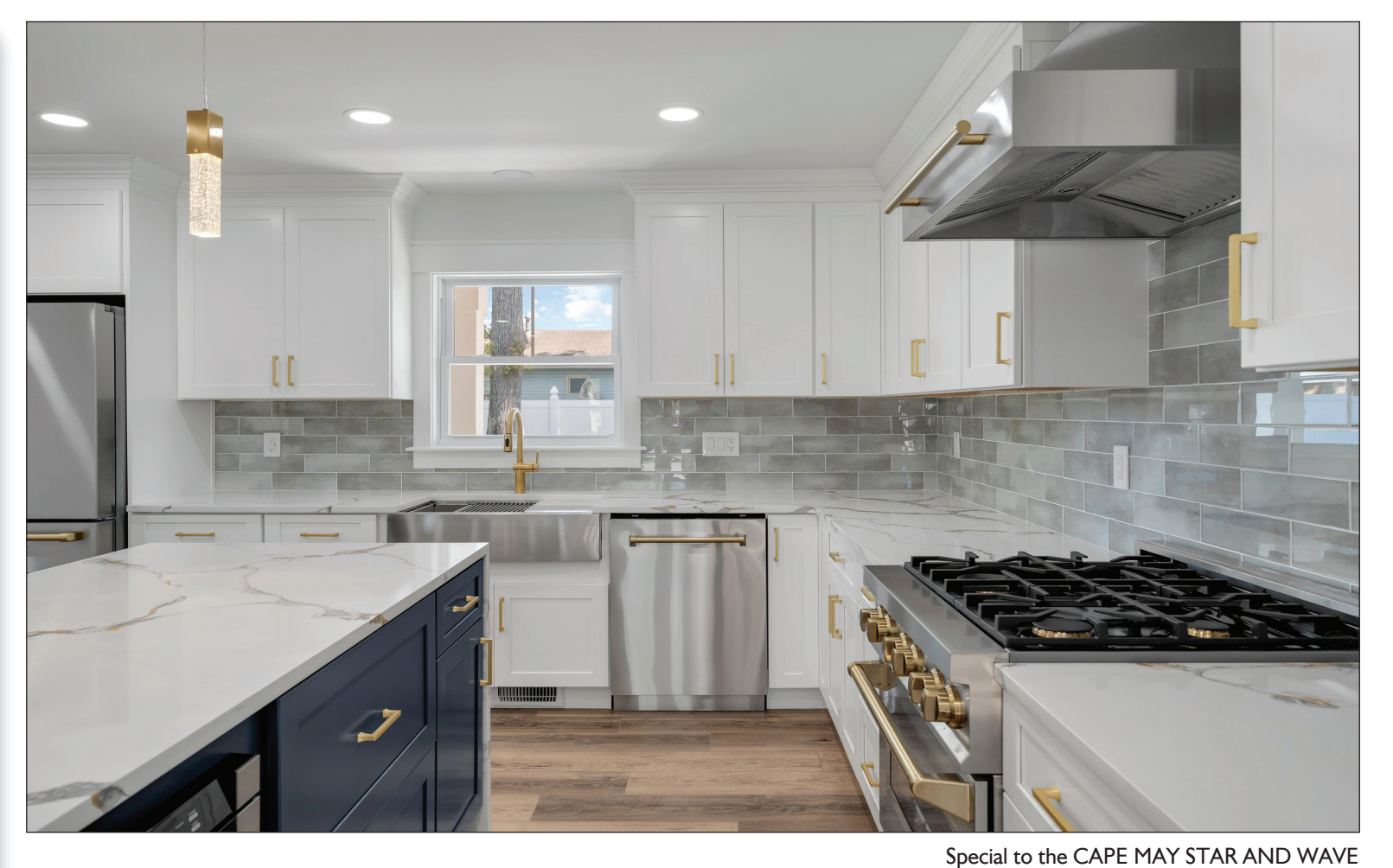
The home at 117 Hollywood Ave. has recently renovated and features five bedrooms, three bathrooms and a magnificent kitchen.

Participants gain the support of peers who understand their experience and gain insight into others' challenges and successes. Participants benefit through others' experiences, discover