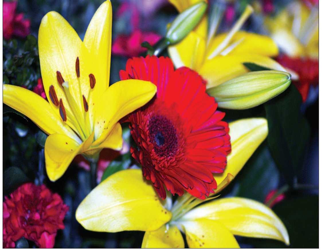
Christopher South/Cape May Star and Wave

projects like the Convention Please see Contract, page A2